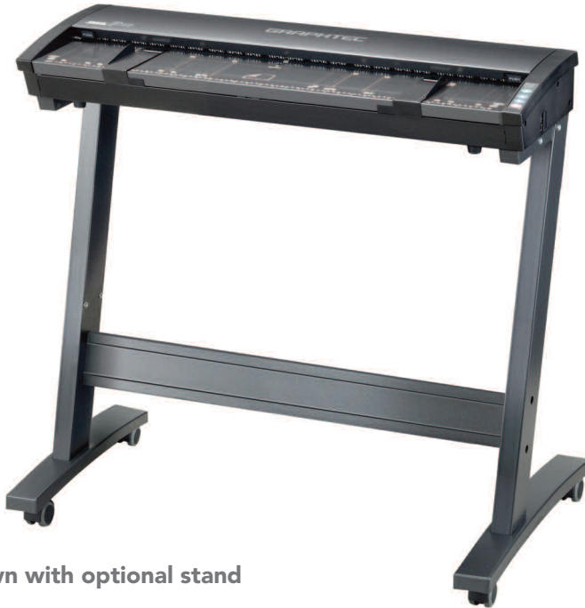
Shown with optional stand

Color & monochrome solutions for large-format scanning and copying featuring the world's fastest scanning speeds with unbeatable accuracy.